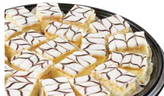
12 MILLE-FEUILLES 20 mini mille-feuilles pastries, 10 with Chantilly cream and 10 with a mix of Chantilly cream and custard. 10 to 12 people