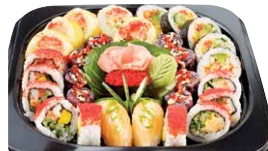
104 KANTO • Futomaki: Spicy shrimp and vegetarian • Maki: Kamikaze salmon • Hosomaki: Red pepper • Nigiri: Salmon • Gunkan masago 2 or 3 people (30 pieces)