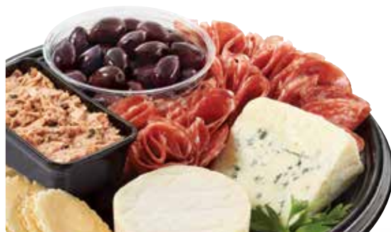
117 COCKTAIL BITES Genoa salami, Les Charcutiers Pork Shop rillettes, Kalamata olives, Ermite blue cheese, La Sauvagine cheese, and crackers. 4 to 6 people