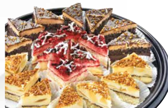
62 STATE OF THE ART An assortment of exquisite cakes: 7 pieces of chocolate and hazelnut crunch, 7 pieces of pear and caramel, and 6 pieces of vanilla and raspberry. 10 to 12 people