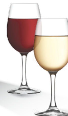
78 79 THE 4-L BOTTLE - ECONOMICAL AND CONVENIENT .....

Discover the simplicity of this convenient size, available for red and white wine.