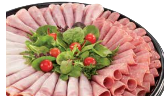
16 ESSENTIALS All the deli favourites put together—salami, mild capicollo, turkey breast, and smoked ham. 10 to 12 people