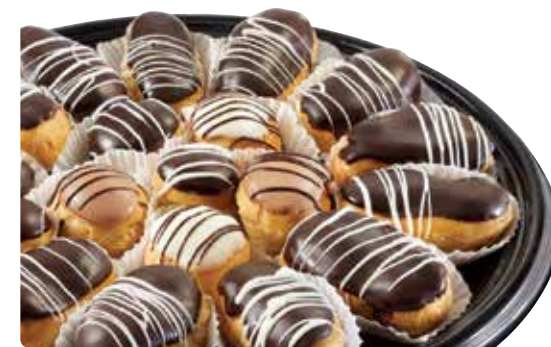
50 PASTRIES 13 mini eclairs with 35% whipped cream and 6 cream puffs—custard, 35% whipped cream and 35% whipped cream with chocolate, coffee, and chocolate. 10 to 12 people