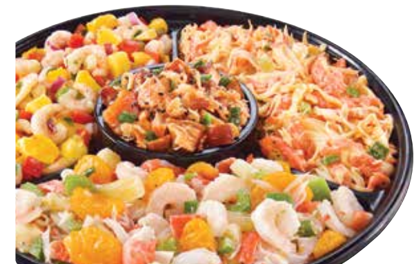
112 SEAFOOD SALAD The perfect quartet: smoked salmon bite salad, spicy imitation crab salad, Nordic shrimp salad, and tropical salad. 10 to 12 people