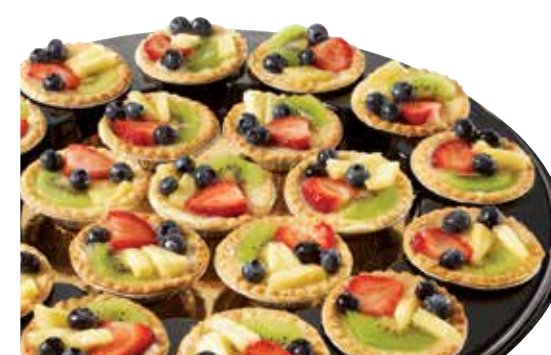
127 FRUIT TARTS 19 fruit tarts (3po) with custard and fresh fruit (pineapples, kiwis, strawberries, and blueberries). 10 to 12 people