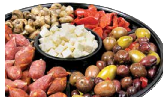
100 DRY SAUSAGE AND ANTIPASTO These grelots sausages make great hors d'oeuvres – chorizo, original rosette de Lyon, and figs and port – accompanied by roasted peppers, a variety of olives, grilled mushrooms, and feta cheese. 10 to 12 people