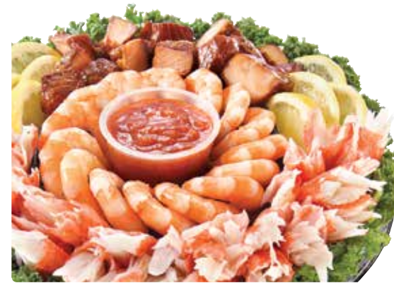
109 PEARL OF THE SEA A hit every time: shrimp ring with cocktail sauce, surimi, and smoked salmon bites 6 to 8 people