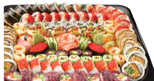
108 AMAKUSA • Futomaki: Vegetarian, Fuji, spicy salmon, and dragon's eye • Hosomaki: Cucumber, avocado, and mango • Maki: Surimi, kamikaze salmon, and spicy shrimp • Nigiri: Tuna, shrimp, and salmon • Green dragon • POKO sushi • Gunkans masago 8 to 10 people (100 pieces)