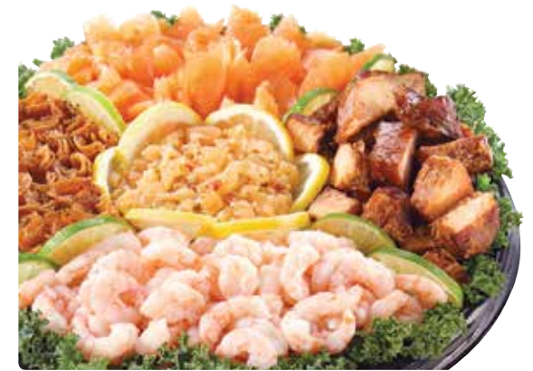
110 OPEN SEA TREASURES A platter combining smoked salmon, honey & spices dry cured salmon, salmon tartare, smoked salmon bites, and Nordic shrimp. 6 to 8 people