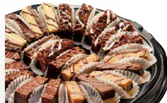
51 QUARTET OF BROWNIES Chocolate, everyone's favourite flavour, served as brownies: Tiger, Haystack, Deep Dutch and Triple Chocolate. 10 to 12 people