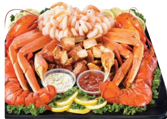
111 ROYAL PLATTER An impressive platter combining lobster, snow crab, shrimp with cocktail sauce, smoked salmon bites, and butter and canola oil seasoned with lemon and herbs. 8 to 10 people