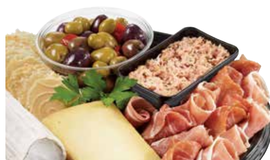
116 COCKTAIL HOUR Prosciutto, Les Charcutiers Pork Shop rillettes, mixed olives, Comtomme cheese, a Chèvre des Alpes goat cheese log, and crackers. 4 to 6 people