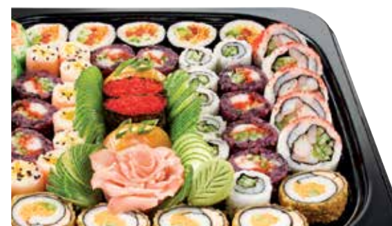
106 OKINAWA • Futomaki: Vegetarian, spicy shrimp, Boston, and dragon's eye • Hosomaki: Mandarine and cucumber • Maki: Surimi • Nigiri: Salmon • Gunkans masago 4 or 5 people (50 pieces)