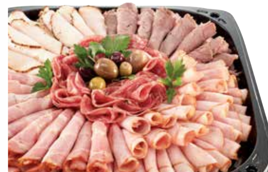
56 DELECTABLE DELI MEATS A platter of fine deli meats for fine palates: Genoa salami, old-fashioned capicollo, dried tomato turkey breast, old-style smoked ham, and Angus roast beef. 10 to 12 people