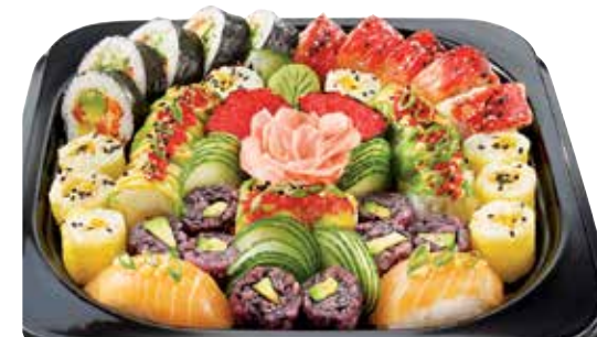
105 MIYAKÉ • Futomaki: Fuji and vegetarian • Hosomaki: Mandarine and avocado • Nigiri: Salmon • Green dragon • Gunkan masago 3 or 4 people (40 pieces)