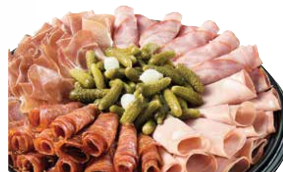
114 ITALIAN DELI MEAT An assortment of spicy capicollo, mortadella, prosciutto, Calabrese dry sausage, and bite-size pickles. 10 to 12 people