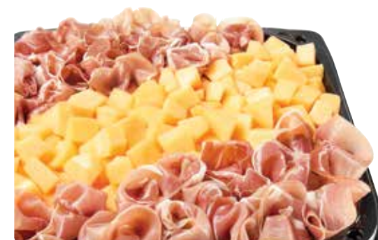
15 PROSCIUTTO AND MELON A unique pairing that never fails to please. 10 to 12 people