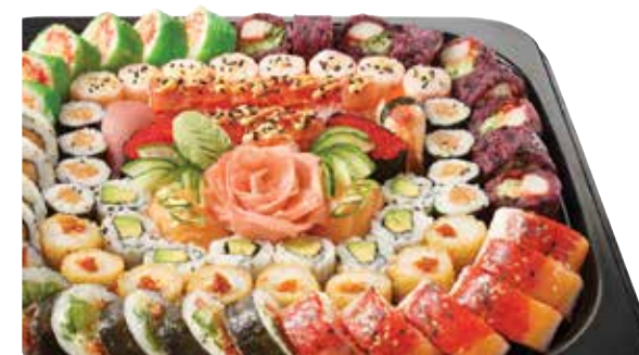
107 HOKKAIDO • Futomaki: Spicy shrimp, vegetarian, Fuji, and spicy salmon • Hosomaki: Salmon, avocado, and lychee • Maki: Surimi • Nigiri: Tuna, shrimp, and salmon • Red dragon • POKO sushi • Gunkans masago 6 to 8 people (75 pieces)