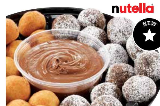
115 DONUT HOLE DUO WITH NUTELLA An assortment to make your mouth water: 12 chocolate donut holes and 12 vanilla donut holes with Nutella. 10 to 12 people Nutella® is a registered trademark of Ferrero S.p.A. All rights reserved.