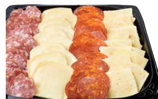
103 RACLETTE The perfect raclette platter: chorizo sausage, original rosette de Lyon, raclette cheese slices, and roasted onion raclette cheese slices. 4 to 6 people